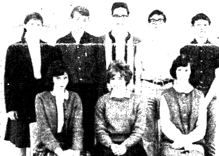
THE SMILES of these Univee musicians are genuine — caused by their recent ratings at the Regional Music Competition held at Bedford recently.

In recent Solo-String Ensemble U-school representatives got high ratings of excellent and superior from the judges. The regional contest, in which students from all over southern Indiana participated, was held on February 6, in Bedford, Indiana.